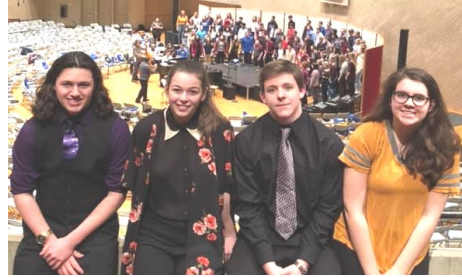
These awesome kids participated in Dorian Vocal Festival at Luther