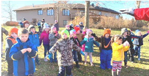
Kindergarten students are doing animal aerobics at Benton County Nature Center. They enjoyed their field trip learning about winter habits for animals. Benton County Naturalists facilitated the activities.