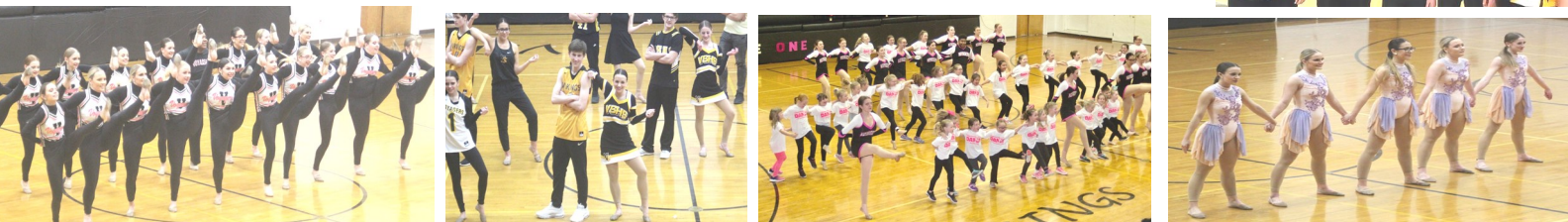
On February 15th the Voyagers presented their spring show; wrapping up their year by showcasing their hard work and talent to a large crowd and sending off the five seniors on the team.