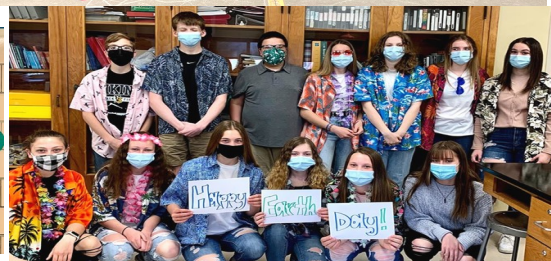
8th Grade students took some time in science class to reflect on what they love about the Earth.