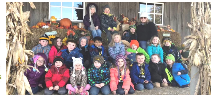
KK Kindergarten class at Bloomsbury Farm