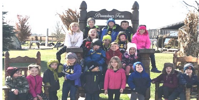
SP Kindergarten class at Bloomsbury Farms