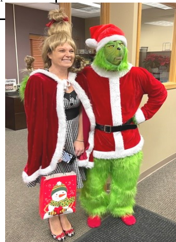
The Grinch and Cindy Lou made an appearance around the district just before Christmas.

In the event that we have snow, ice, or fog...we will do our best to announce our plans as soon as possible. If we have a cancellation or a delay, you should get a text/email or see it on the news channels shortly after 6am. When possible, we may make an announcement the night before. However, that is hard sometimes when the weather forecast can change quickly. Please spend some time now making plans on what you will do in the event of a snow delay or snow day with your children. If they are older, and they can drive, please take some time and discuss winter driving with your teenager. The first snowfall is often the one teenagers have the most problems with.