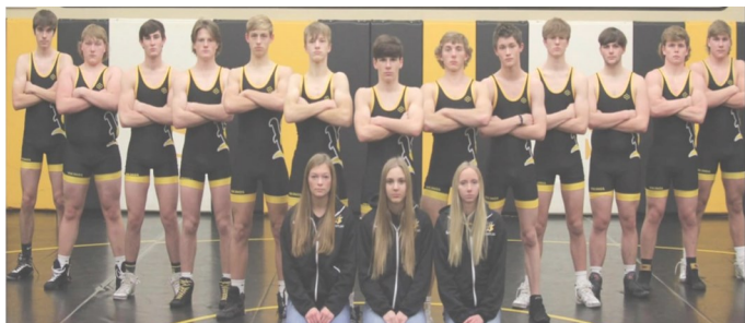
Boys 2A Team Rankings - December 17, 2021