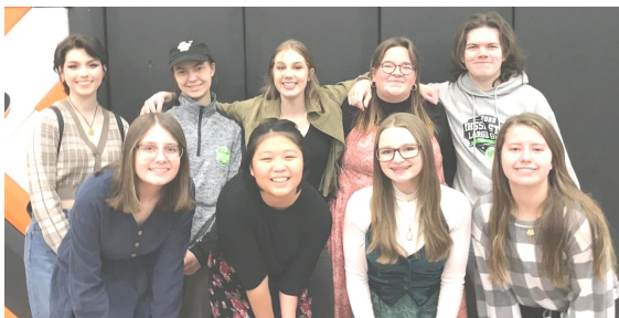
Iowa High School Speech Association's State Individual Events performers.